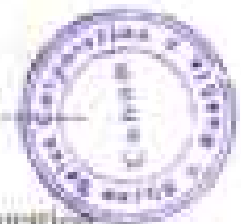
Director SHREE SALES Corporation